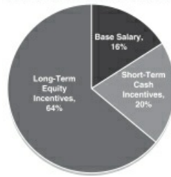
President & Chief Executive Officer