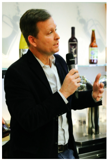
Bill Newlands President and Chief Executive Officer

"Our capital allocation strategy remains unchanged and includes a focus on maintaining an investment-grade rating, returning capital to shareholders through dividends and share repurchases, and investing in the growth of the business. In fiscal 22 alone, our strong operating results and powerful cash generation capability enabled us to return almost $2 billion in capital to shareholders as part of our $5 billion commitment by the end of fiscal 23."