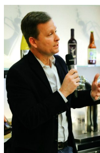
Bill Newlands President and Chief Executive Officer

"Our strong performance drove record cash flow results which we used to reduce debt to our targeted leverage range while returning value to shareholders through dividends and share repurchases. In this time of uncertainty, we believe we have ample liquidity and financial flexibility and remain committed to our investment grade rating. We have significant capacity under our $2 billion revolving credit facility and we plan to carefully manage our debt position over the next 24 months. In addition, we are expecting approximately $850 million in cash upon the close of the Gallo transaction and we remain focused on prudently navigating the challenging operating environment presented by COVID-19."