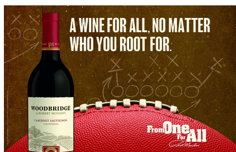
Woodbridge new football campaign