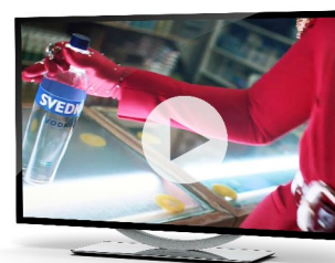
SVEDKA Vodka’s first national campaign in over five years encourages its audience to “Bring Your Own Spirit.”