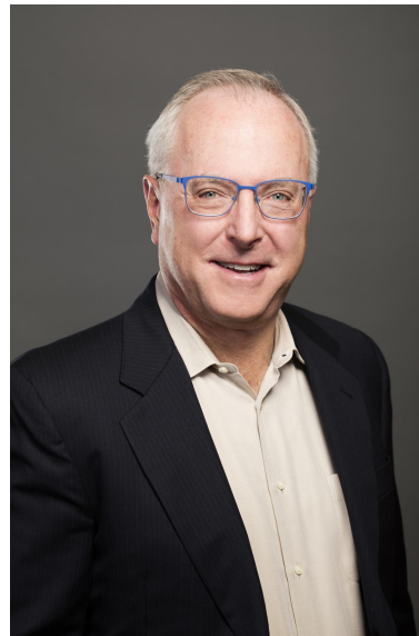
President and Chief Operating Officer